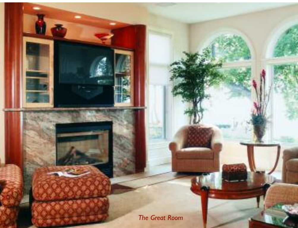
The Great Room