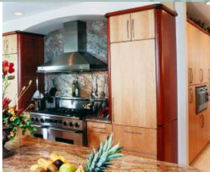
Professional range flanked by SubZero refrigerator and freezer.

The cabinets are high-end custom frameless