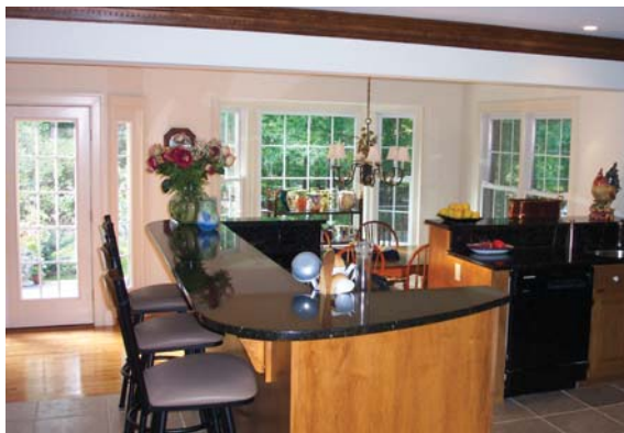
Above: The kitchen snack bar invites one to take a seat and enjoy.

New kitchen, family room or sunroom addition, remodeled basement or attic, whatever your dreams for your home, call Lane Homes & Remodeling, Inc. at 784-0012 and let our experienced and talented design team create the perfect solution for you. □