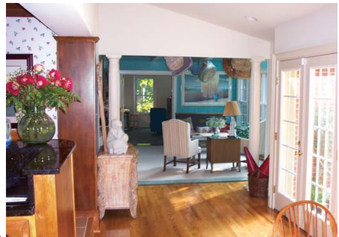
Right: A view to the cheerful sunroom from the new kitchen.