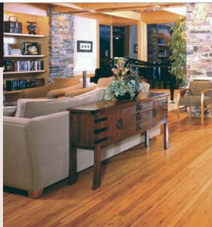
Exquisite site-finished flat grain "caramelized" bamboo flooring.

One very appealing advantage bamboo flooring offers is that it is produced from an environmentally sustainable and rapidly renewable resource. Hardwood trees require 40 to 60 years to grow.