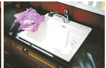
Above: The SinkSpa™ jetted sink. Three micro-jets swirl water to gently clean your delicates and hand-washables.