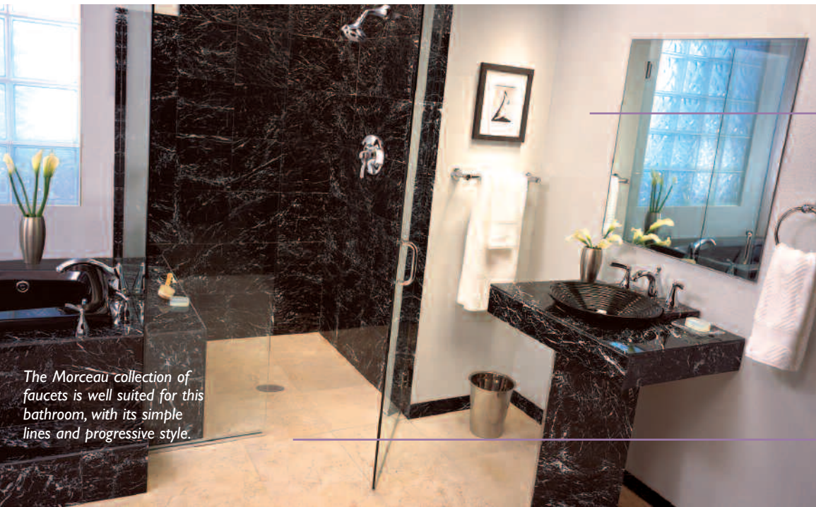
The Morceau collection of faucets is well suited for this bathroom, with its simple lines and progressive style.