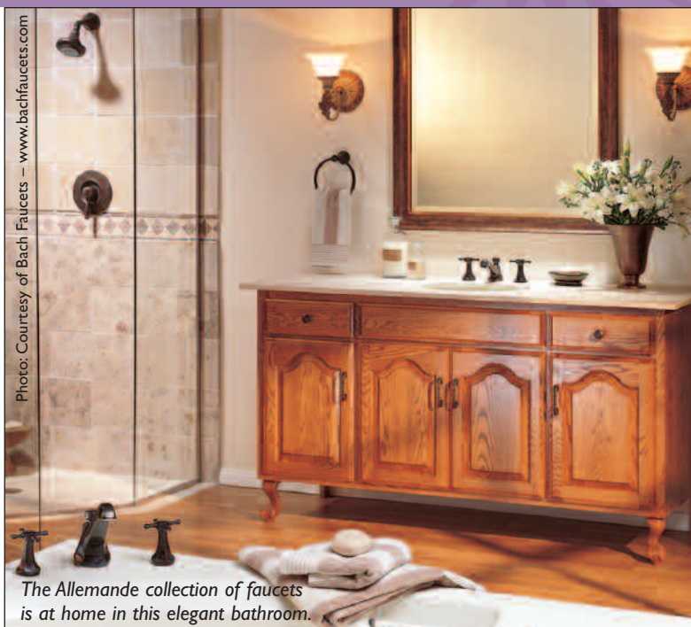
The Allemande collection of faucets is at home in this elegant bathroom.

Following the trend in kitchens, bathroom cabinetry has the furniture look. Designers are adding a sink to an elegant piece of traditional furniture to create the vanity. The exposed legs and decorative hardware add charm to the surroundings. A contemporary vanity with pure, clean lines may also be free-standing, or may be supported on the wall 9"-12" above the floor. Vanity tops and countertops are usually solid surface, stone or tile, with