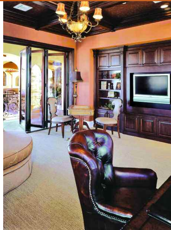
The folding glass wall expands the sitting room to the outside, bringing in light and fresh air.