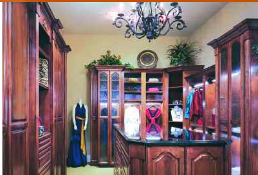
Stylish lighted closet rods add sparkle to this walk-in closet.

those parents who simply want a quiet respite from the pre-teens who seem to have taken over their house. An addition to their home provides a tranquil spot for a master suite retreat. Or perhaps it is simply that the homeowner spent some wonderful days in a five star hotel suite with all the creature comforts, and now wants to recreate that luxurious atmosphere with his own "house candy." Whatever the reason for the decision,