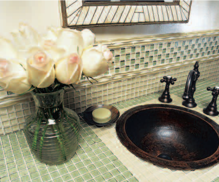
Illuminescence glass tiles are textured front and back, causing surfaces to come alive with unusual visual depth.