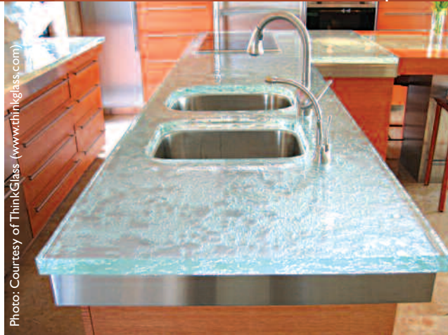
The intriguing texture in this 1-1/2" thick ThinkGlass countertop was formed within the glass, while the surface remains silky smooth.

Since glass is non-porous, it is very hygienic and does not accept stains or bacteria. Clean it with any standard glass-cleaning product. Although glass is highly cold-and-heat-resistant, manufacturers recommend that pots taken directly from the oven be placed onto a hotplate whenever possible. Glass is very durable, but it can scratch. Minimize this problem by choosing matt finishes for glass floor tiles in high-traffic areas. Having a texture beneath the surface of a glass countertop helps to mask wear and tear.