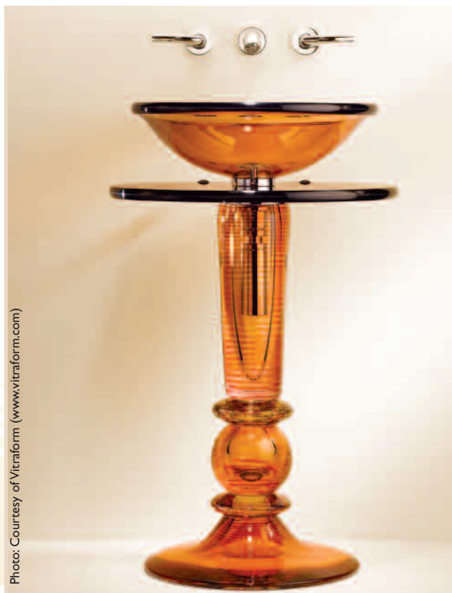
The elegant hand-blown glass Coppa pedestal in “Peach” coordinates with a laminated glass vessel sink.